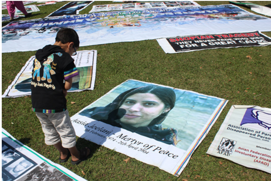
A child looks at the poster exhibition before the Haqeeqat-e-Kashmir event, September 2013.

movement and assembly by civilians; the unconstitutionality of Village Defence Committees and other informal state forces; and the state's refusal to share details of official probes and enquiries conducted by it since 1990; remain pending today.