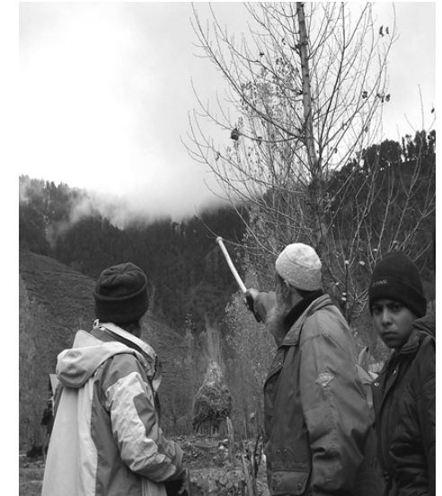
International CAMPAIGN TO BAN LANDMINES 2006-2007 Kashmir Mission Report