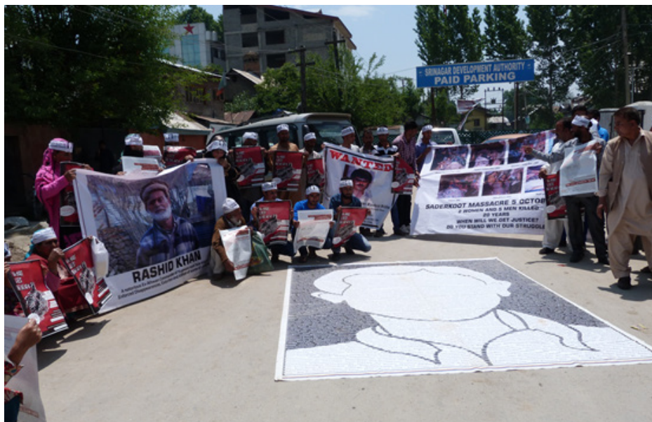
Members of APDP, and families of victims of the Saderkote Bala Massacre (1996) hold a joint protest in Srinagar, against state impunity for human rights abuses, 2016.