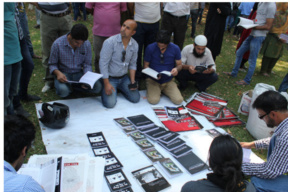
JKCCS reports for sale and distribution at the Haqeeqat –e –Kashmir concert, September 2013.